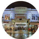
ST KEVIN'S ARCADE