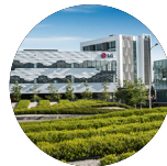
HIGHBROOK BUSINESS PARK