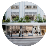
246 QUEEN STREET