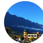
REMARKABLES PARK QUEENSTOWN