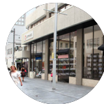
FORT STREET REDEVELOPMENT